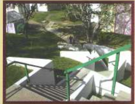
Views of Rex Nettleford Hall