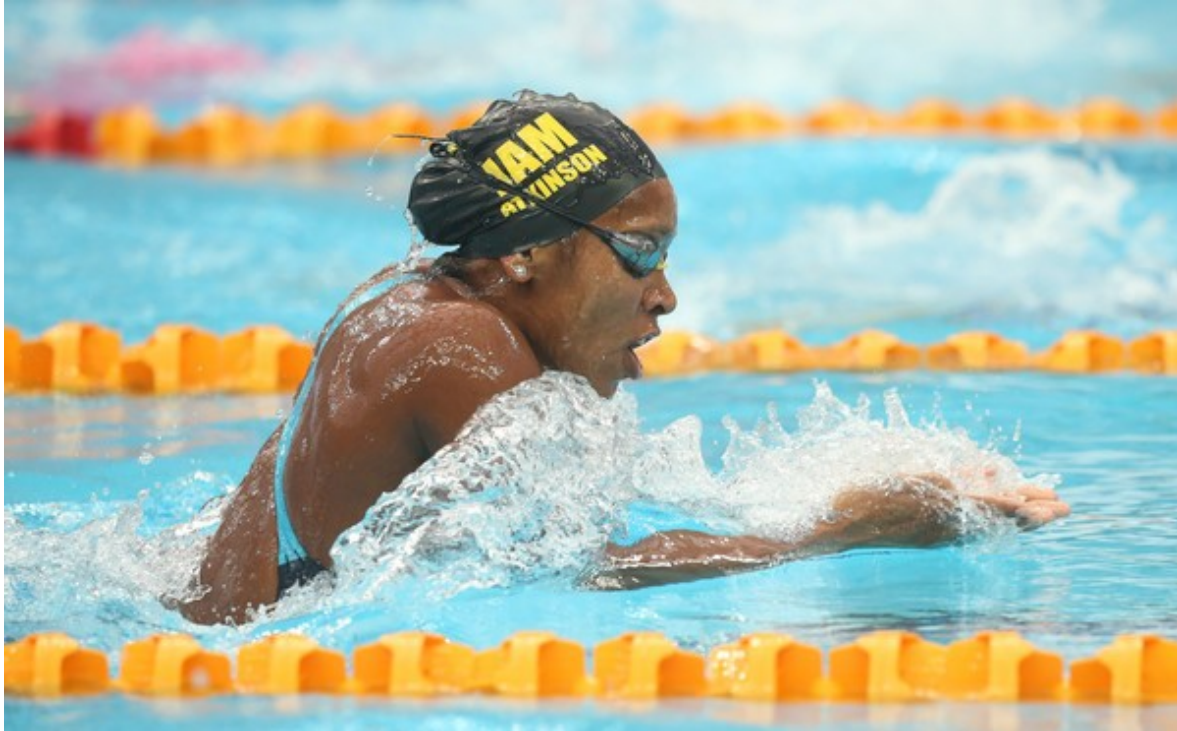
Alia Atkinson of Jamaica competes in the Women's 100m breaststroke at the FINA swimming world cup 2016 at Water Cube on Sept. 30, 2016 in Beijing, China.