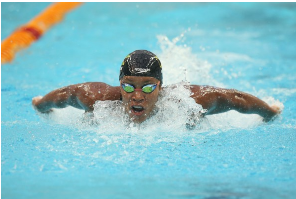
Alia Atkinson of Jamaica competes in the Women's 200m Individual Medley on day one of the FINA swimming world cup 2016 at Water Cube on September 30, 2016 in Beijing, China.