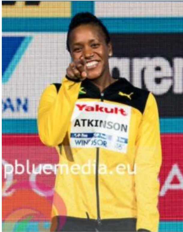
Alia Atkinson

The journey to becoming a Double World Champion in the event was not easy and sure. In her foray at these World Championships in 2004 in the United States she finished 19 th . But with hard work and determination she moved her way to the top of her sport which other swimmers from the region can use as inspiration for their goals in the sport. Her journey at these World Championships are seen below