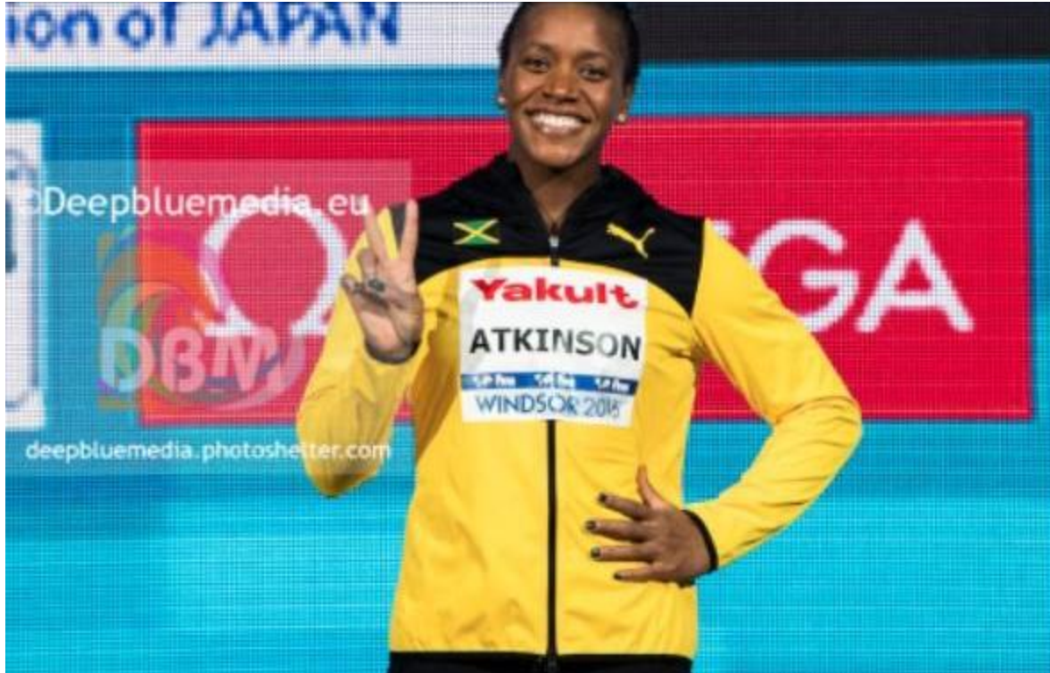
Alia Atkinson

On Saturday Dec 10, 2016 Alia Atkinson gave herself an early birthday present by winning a historic 100 metre breaststroke Gold medal that brought more pride to Jamaica, the CARIFTA region and the wider Caribbean.