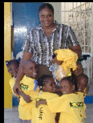
Happy faces from the Central Academy ECDC