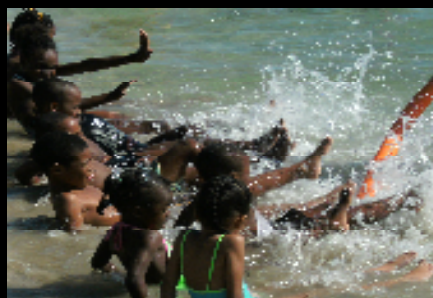
Children from Providence Kinder-Prep at the Lyssons Beach