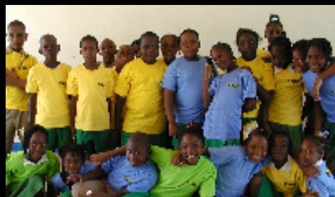
Children from Mona Heights Primary posing in their SwimJamaica T-shirts